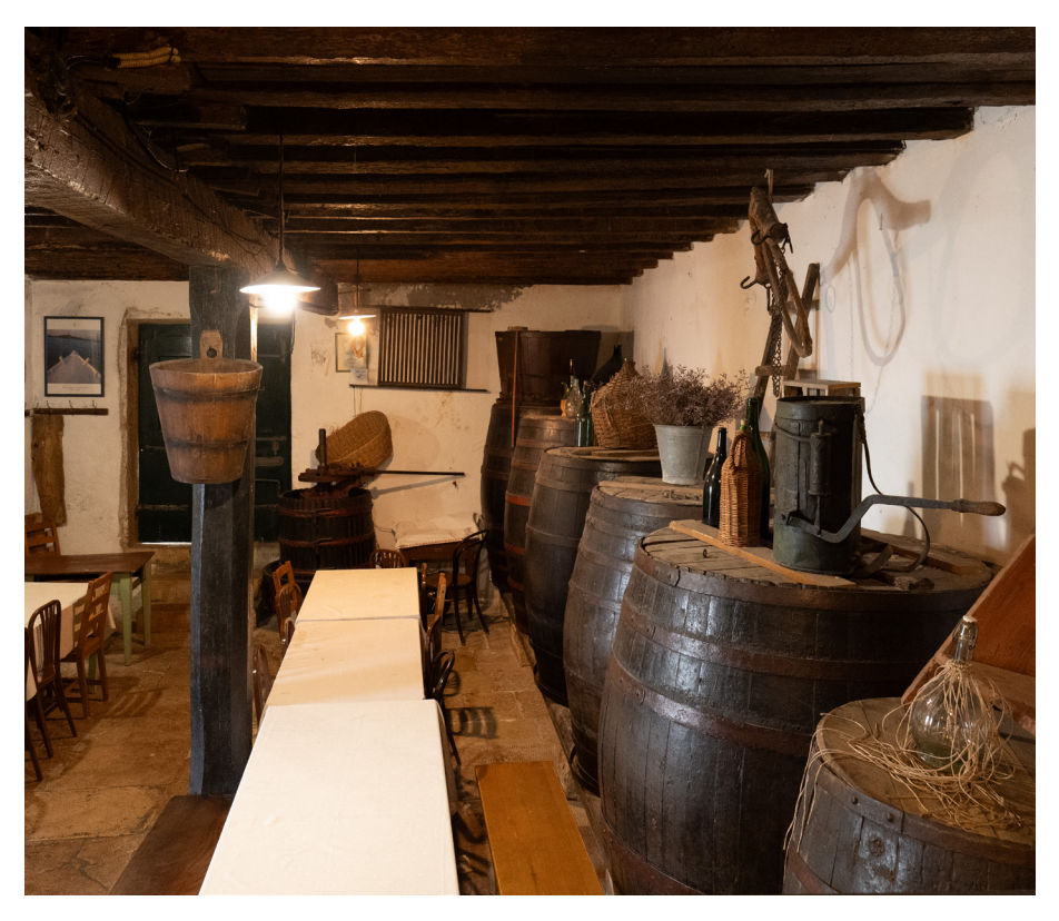
Figure 2. The interior of Spàcio Matika. Photo by the author, February 18, 2023