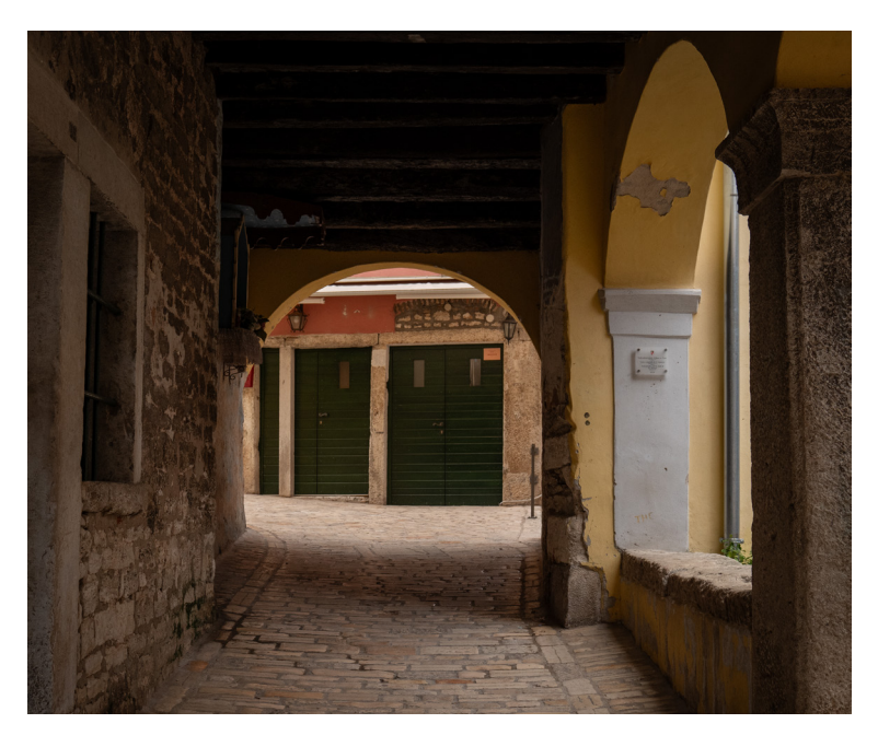
Figure 4. The vuòlto near the church of St. Thomas ( San Tumàn ).