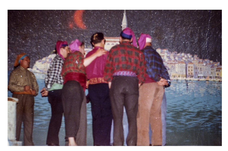
Figure 1. An ària da nuòto perfomed in a bozzetto folkloristico . Rovinj-Rovigno, ca. 1970.

the turn of the 19<sup>th</sup> and 20<sup>th</sup> centuries. Much like other «collective forms of self-representation of local traditions»,<sup>32</sup> it seamlessly blends elements of local folklore with the theatrical creativity of gifted playwrights such as Giusto Curto (1909-1988) and Giovanni Pellizzer (1901-1991). A defining feature of the bozzetto is the presence of sung segments, prominently featuring the three most practiced polyphonies ( bitinàda , ària da nuòto , and ària da cuntràda ). These musical moments, akin to those found in musicals, can serve a narrative purpose or amplify the emotional situation. Therefore, the singing of an ària da nuòto often accompanies a nighttime scene, heightening the intimacy of the moment (see Figure 1).