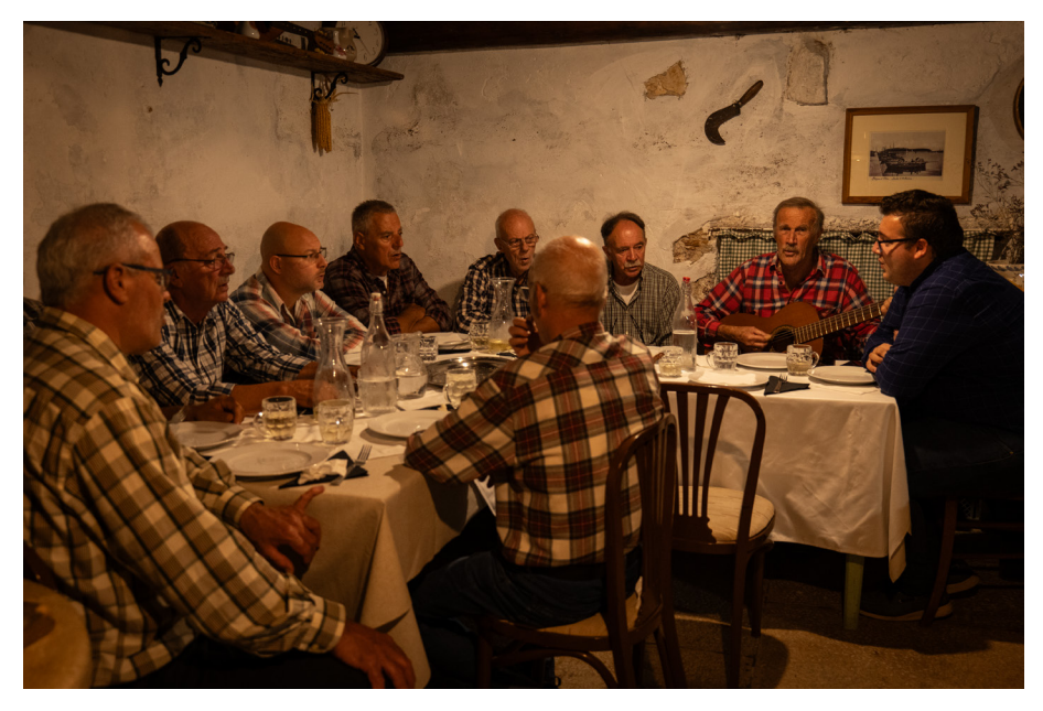
Figure 3. I bitinadòri performing at Spàcio Matika. Photo by the author, February 19, 2023