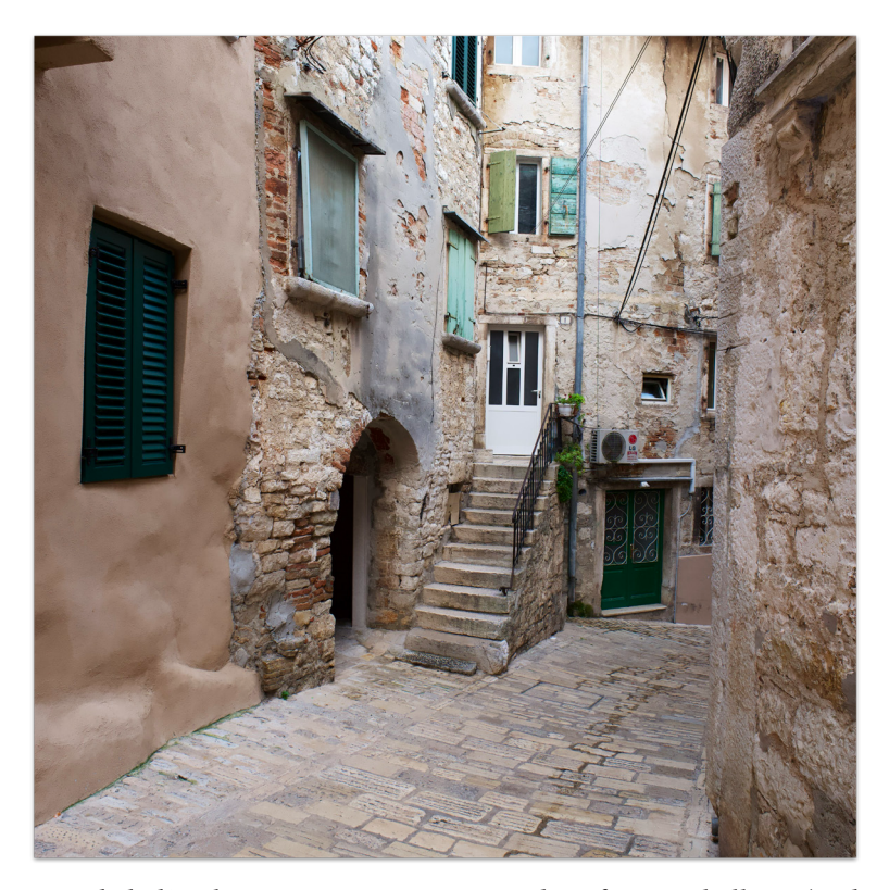
Figure 5. A baladù r, the exterior stairway, ascending from its hallway (andru\`one) . Photo by the author, February 19, 2023