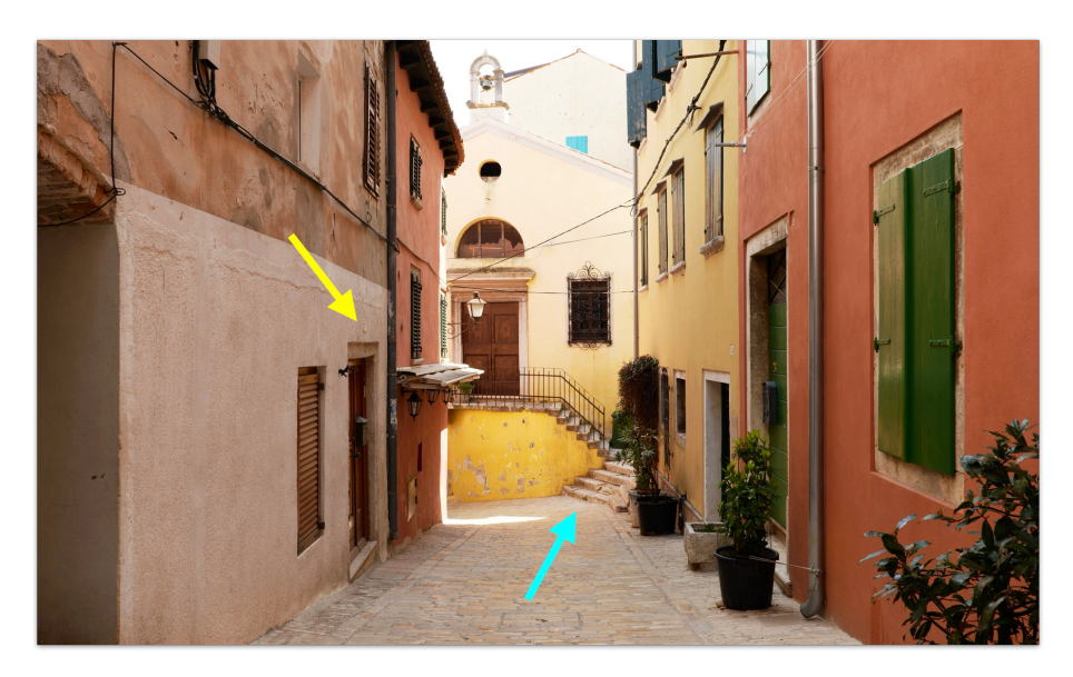
Figure 9. The house of the Banich family and the scalite (staircase) of the Church of San Tumàn (St. Thomas). February 19, 2023