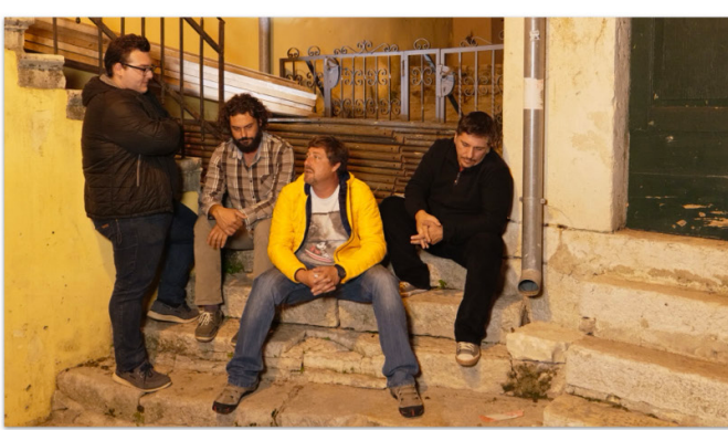
Figure 10. The vocal quartet Nuove Quattro Colonne explores the acoustics of the staircase of San Tumàn (St. Thomas) on October 20, 2022 (four frames from the documentary Tre voci, una città / Three Voices, One Town by the author, in preparation)